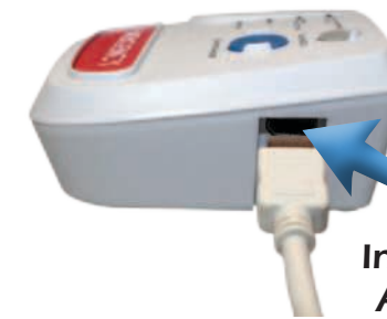
Input jack for Cell Accessory cable